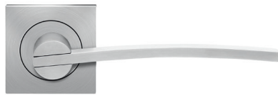
Kioto – TER72Q 2 1/16" x 2 1/16"