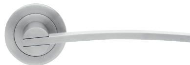
Kioto – TER72 Ø 2 1/16" x 7/16"