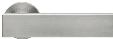
Milano – TER52 Ø 2 1/16" x 7/16"