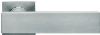
Milano – TER52Q 2 1/16" x 2 1/16"