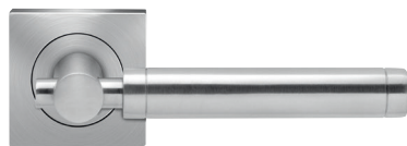
New York – TER65Q 2 1/16" x 2 1/16"