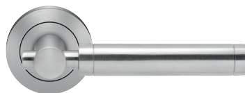
New York – TER65 Ø 2 1/16" x 7/16"