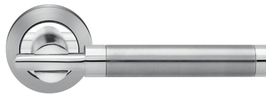
Ontario – TER64 Ø 2 1/16" x 7/16"