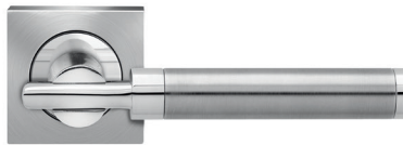
Ontario – TER64Q 2 1/16" x 2 1/16"