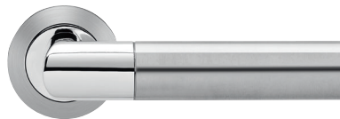
Oregon – TER48 Ø 2 1/16" x 7/16"