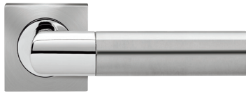
Oregon – TER48Q 2 1/16" x 2 1/16"