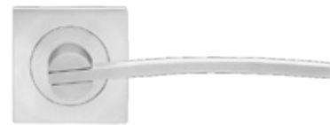
Kioto- TER 72Q 2 1/16" x 2 1/16"