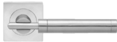
Ontario- TER 64Q 2 1/16" x 2 1/16"