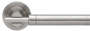
Ontario- TER 64 Ø 2 1/16" x 7/16"