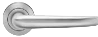
Elba – TER22 Ø 2 1/16" x 7/16"