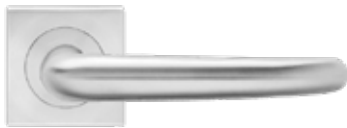
Elba – TER22Q 2 1/16" x 2 1/16"