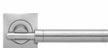
Ontario – TER64Q 2 1/16" x 2 1/16"