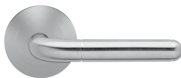
Lignano Steel – UEPL35 Ø 2 5/8 x 7/16"