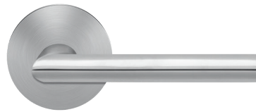
Verona – UEPL37 Ø 2 5/8 x 7/16"