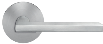
Montana – UEPL54 Ø 2 5/8 x 7/16"