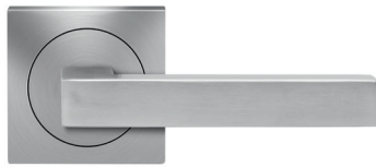
Seattle – UER46Q 2 5/8 x 2 5/8 x 7/16"