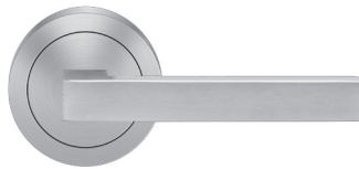
Seattle – UER46 Ø 2 5/8 x 7/16"