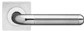
Lignano Steel – TER35Q 2 1/16" x 2 1/16"