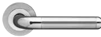
Lignano Steel – TER35 Ø 2 1/16" x 7/16"