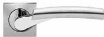
Atlantis – TER36Q 2 1/16" x 2 1/16"