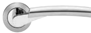
Atlantis – TER36 Ø 2 1/16" x 7/16"