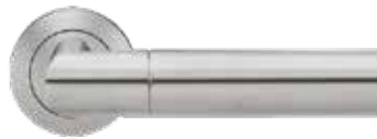
Oregon – TER48 Ø 2 1/16" x 7/16"