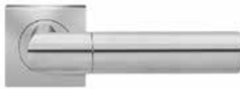
Oregon – TER48Q 2 1/16" x 2 1/16"